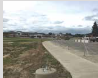
Sidewalks, lighting, and a wider culvert are added to Championship Drive from Shelby Middle School to the new stadium for improved safety.