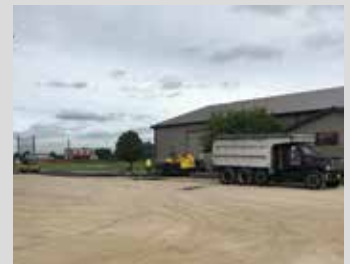
Asphalt work is happening around campus this summer, including Championship Drive and the Shelby Middle School parking lot.