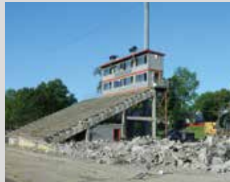
Skiles Stadium is demolished and the area is ready for future activity.