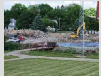
Central School demolition wraps up.