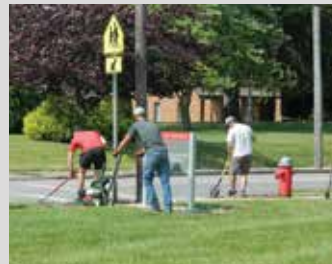
Did you know? The Shelby Schools maintenance crew is responsible for landscaping around Shelby Middle School and the board office.