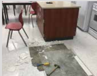
Shelby High School classrooms undergo remodeling.