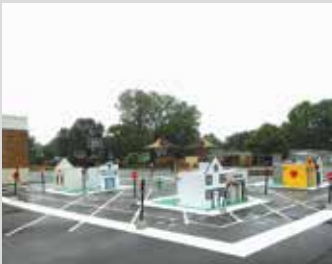
Safety Town moves from Dowds School to the PK-8 building's secure playground.

In addition to the following maintenance projects taking place this summer, all drinking fountains in Shelby Schools are being replaced with bottle fillers.