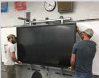
More than 80 bulletin boards and 40 Clevertouch boards are installed throughout PK-8 classrooms and Shelby High School.